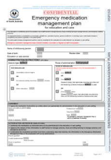
Emergency medication management plan to administer midazolam for seizures